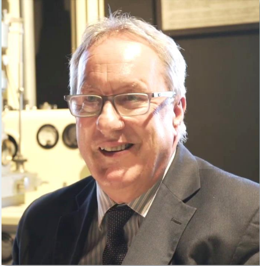
Dr Charles Price DG SANTE, European Commission